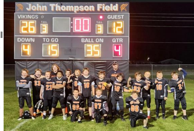
Youth Tackle Football -Played 4 games (Tied 1 st game & won the other 3 games!) Well, done team & coach!